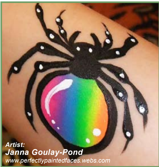
Artist: Janna Goulay-Pond www.perfectlypaintedfaces.webs.com

Many face painters find round sponge pouncers, also known as daubers, to be an indispensable part of their kits. These little tools are fabulous at creating perfect circles, wonderful spherical shading and multi-colored effects, and make your quick designs look a lot more painstaking than they actually are. Having the round sponge on a handle also comes in very handy if you use stencils for your painting, as they help keep your fingers clean. Pouncers make beautiful and consistent beads for your painted jewelry designs! Even if you only use one color at a time, pouncers are fabulous for creating perfectly round circles in seconds, for simple designs such as basketballs, planets, smiley faces, etc! The possibilities are endless when you think in terms of circles. Think fish, turtle shells, insects, beads, eyeballs, teddy bears, puppies, flowers, peace signs, reptile scales... Check out page two for some instructions to get you started, and be sure to click on each image to the left for a link to explore each artist's website! Many thanks to Janna, Ainslie & Kumi for allowing me to share their great pouncer designs!