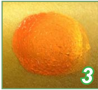
3 Twisting the pouncer creates a spherical effect, with the yellow as a highlight and red as a shadow.