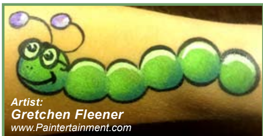
Artist: Gretchen Fleener www.Paintertainment.com