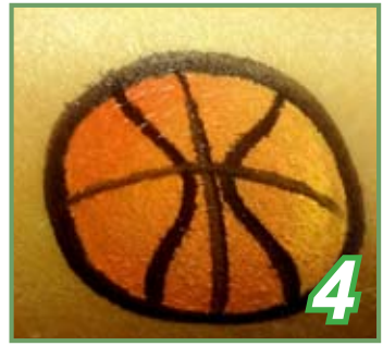
4 Add your outlines and you're done! Try this technique on baseballs, smiley faces, planets, and more!