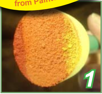
1 Load the pouncer by pressing and twisting it in your orange, then touching one edge in red and the other yellow.