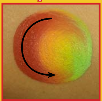
Pressing down and twisting the dauber creates a blended spherical effect.