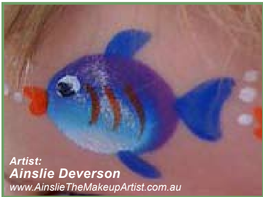
Artist: Ainslie Deverson www.AinslieTheMakeupArtist.com.au

Many face painters find round sponge pouncers, also known as daubers, to be an indispensable part of their kits. These little tools are fabulous at creating perfect circles, wonderful spherical shading and multi-colored effects, and make your quick designs look a lot more painstaking than they actually are. Having the round sponge on a handle also comes in very handy if you use stencils for your painting, as they help keep your fingers clean. Pouncers make beautiful and consistent beads for your painted jewelry designs! Even if you only use one color at a time, pouncers are fabulous for creating perfectly round circles in seconds, for simple designs such as basketballs, planets, smiley faces, etc! The possibilities are endless when you think in terms of circles. Think fish, turtle shells, insects, beads, eyeballs, teddy bears, puppies, flowers, peace signs, reptile scales... Check out page two for some instructions to get you started, and be sure to click on each image to the left for a link to explore each artist's website! Many thanks to Janna, Ainslie & Kumi for allowing me to share their great pouncer designs!