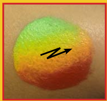
Pressing down and just barely wiggling in the direction of the paint slices lays down stripes