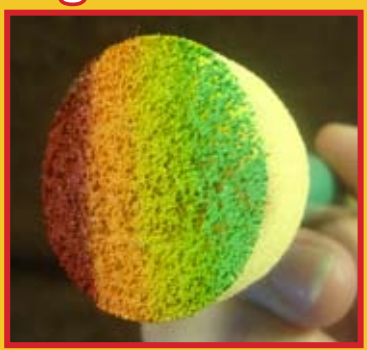
Pouncer loaded with a rainbow cake