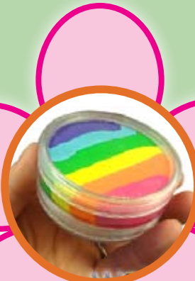
Wolfe Neon Rainbow Cake $16.00