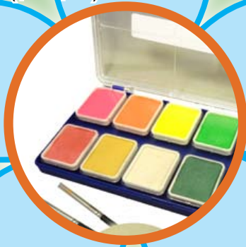
Wolfe 6 & 12 color Neon and Metallix "Appetizer" Palettes ($20-$40)