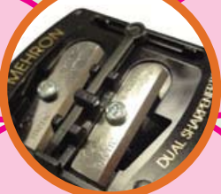
Mehron Pro Pencil Sharpener ($5.00)