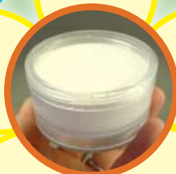
Wolfe White & Black ($11-$19)