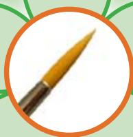
Wolfe Superior Round Synthetic Brushes ($3-$3)