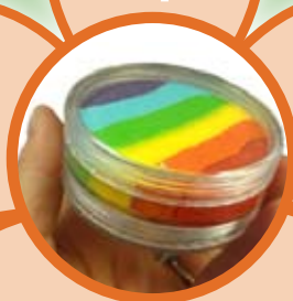
Wolfe Rainbow Cake $12.00