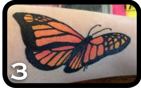
3 Finish off all of the black details, body and antennae. I'm using Wolfe black.