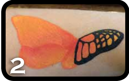
2 Add darker orange cast shadows and begin adding the black details.