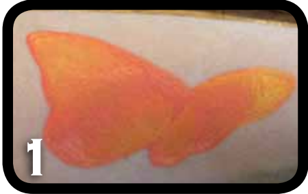
1 Paint your overall wing shapes with orange & add some yellow highlights.

In this design, and most of my ultra realistic paintings, I use two types of black and white: glycerine-based (Paradise & Kryolan in my kit) and wax-based (Wolfe). Both types have a place in my kit. Glycerine-based paints behave more like watercolor and are easy to blend, thin and feather, while wax-based paints are super opaque and bold.